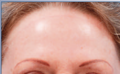
Five weeks after ProFractional XC Tx